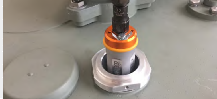
Figure 4. Installation in OLTP top hatch

When developing and testing the sensors, special attention was paid to the use of modern materials and energy-