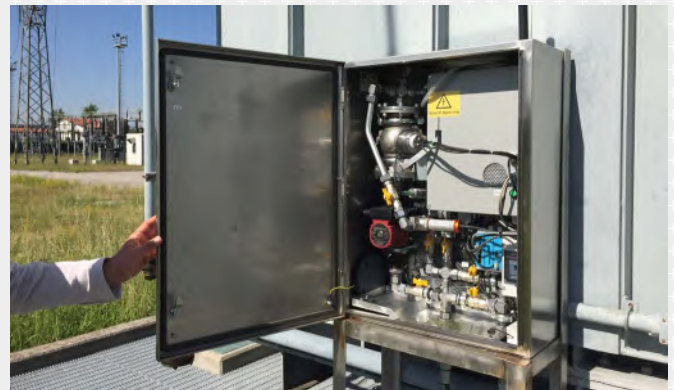
Figure 2. A bypass cabinet with oil pump and sensors

insulated high-voltage system? The measurement practice that has been common up to now "only" provides us with a snapshot under laboratory conditions, the measurement done of the oil parameters under IEC guidelines – usually at 20°C – cannot provide any information on the behavior of the oil at operating temperatures which are greatly deviating from 20°C; also keeping in mind that an error due to falsifying oil samples by incorrect human handling is omnipresent.