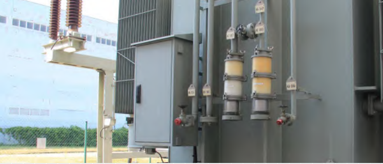
Figure 1. Typical connection and sampling field of a 40 MVA, 110 kV/15 kV transformer