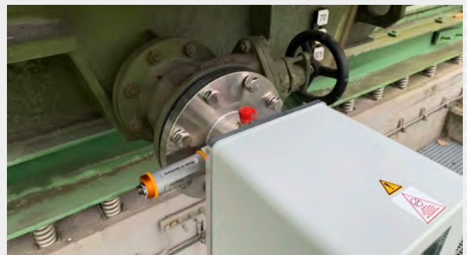
Figure 3. Direct installation on the transformer oil connections – with DGA, moisture and break-down-voltage sensors

Just imagine a cabinet created by Passero containing a sensor connected to the transformer oil filler necks or to the top/bottom oil check valves as a bypass to a transformer to feed the oil, in a closed circuit with an average capacity of about approx. 1.4 m 3 /h, see (Figure 2) or other online systems such as online DGA (Figure 3).