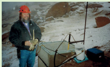
Field testing on Pikes Peak, CO with primitive equipment in 1996