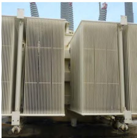
Before: Original manifold assemblies

The cooling system was converted from an ON/ONAF/OFAF type to a primary OFAF type with redundancy. The center of mass was improved by 65% allowing the customer to have a system supported by the primary transformer pad rather than the transformer radiators in a cantilevered fashion. The weight of the system was reduced from nearly 30 tons to 5,3 tons (Figure 4).