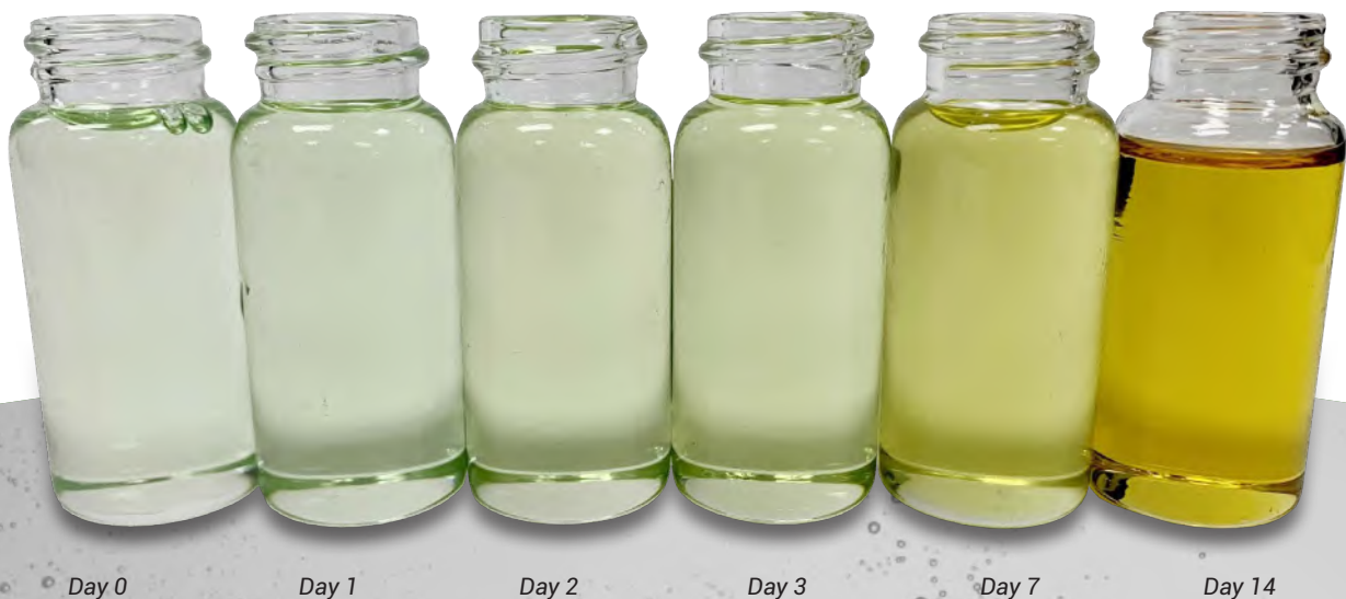
FR3 fluid sample performance under test: ageing and oxidation

Two years ago, over 2.5 million transformers were estimated to have already been produced with just one brand of natural esters. The expectation is that today this number would have exceeded 3 million units.