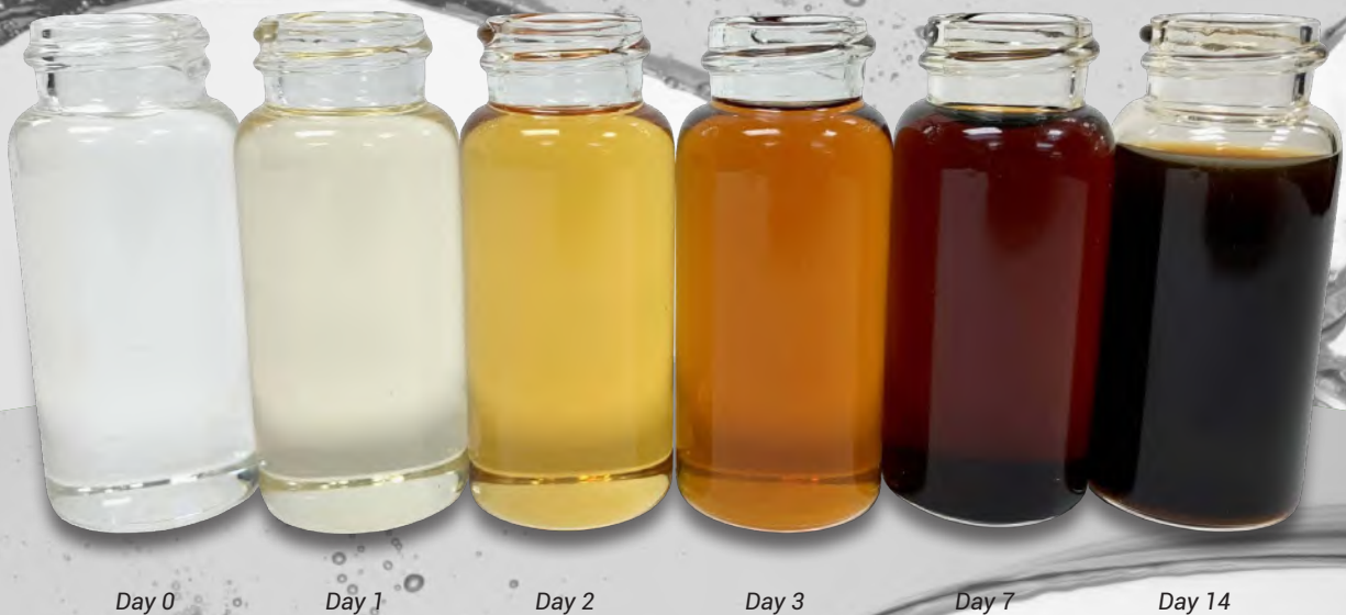
Mineral oil sample performance under test: ageing and oxidation