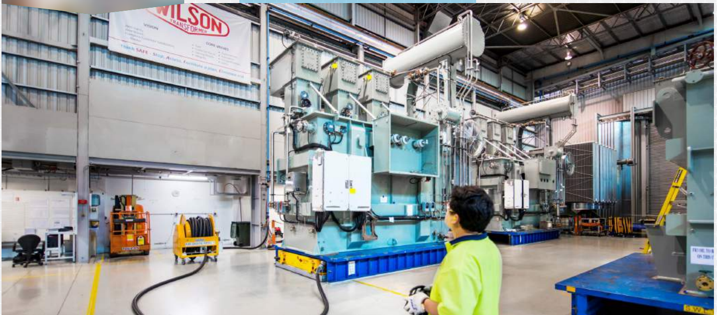
Wilson Transformer Company

Several manufacturers of transformers have used Solving's Air Film Movers a long time to assemble windings, cores and active parts and to move them into vacuum ovens. Air film technology provides all the necessary freedom and flexibility for moving completed transformers weighing up to 700 tons. Electrical drive units and integrated batteries improve the flexibility of the Mover and allow it to be operated without load free of any trailing cables or air hoses; these are connected only when a loaded steel pallet is to be moved. The Movers can be used individually for smaller transformers or as a combination of two or three units controlled from a single radio control console.