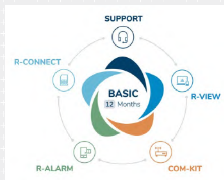
MVA Support Platform

Furthermore, having the possibility to perform site or factory acceptance tests and as well as training remotely, MICAFLUID is able to drastically reduce its carbon footprint.