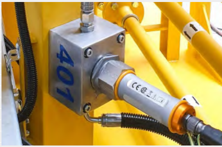
MicaSonic™ applied on a VOP plant to measure - Breakdown voltage [kV] - Moisture content [ppm] (@ 20°C and actual temperature as per IEC)