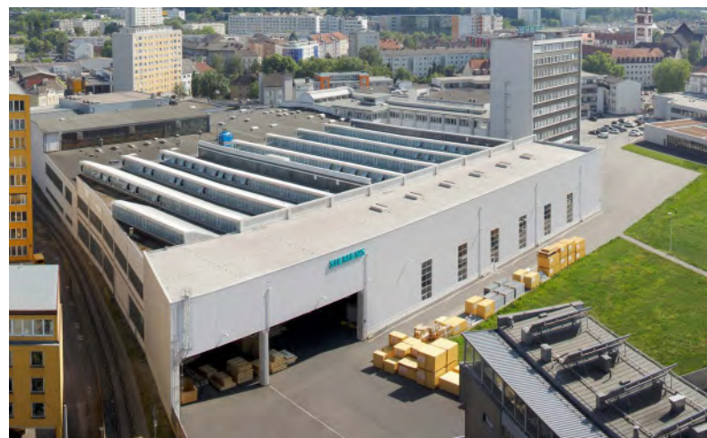
Siemens transformer factory in Linz, Austria, today.