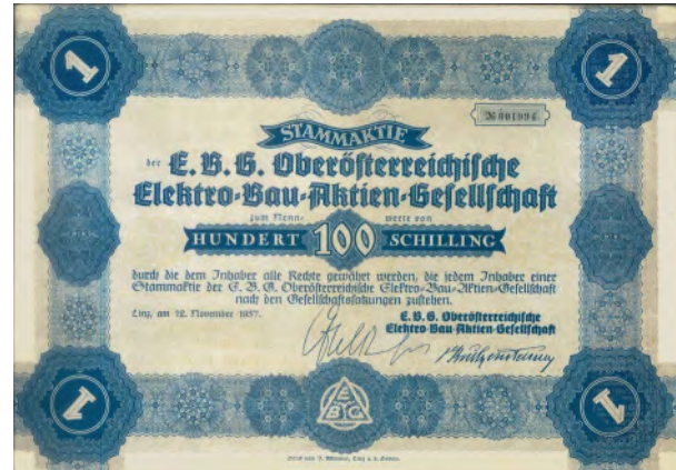
1920 is the year it all started with the foundation of the O.Ö. Elektro Bau GmbH (EBG). In the picture: EBG share, 1937.