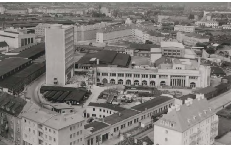
Siemens Transformers Linz plant, around 1954 with new built high-rise building.