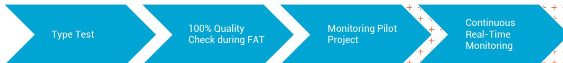
Figure 2. Evolution of adoption