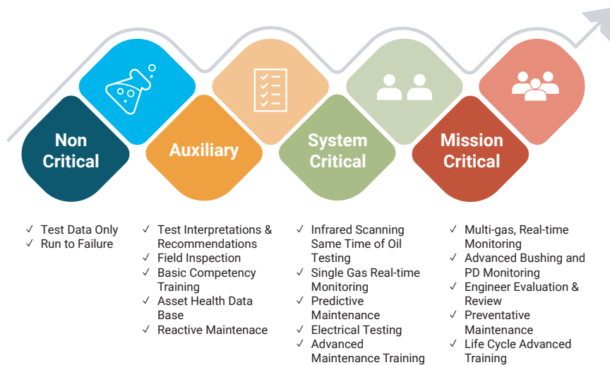
Figure 2. Best practice for transformer reliability should be based on criticality, history, and risk

Anyone who is not part of the solution could potentially be a barrier. In Figure 3 I show everyone who can influence the process of culture change in terms of electric power reliability. I'll focus here on the challenges with Procurement versus Purchasing, why it's important to involve IT from the beginning, and the benefit of using Risk Management professionals to lend expert credence to the concept of electric power system reliability. In my experience, these areas are where many of the major barriers arise.