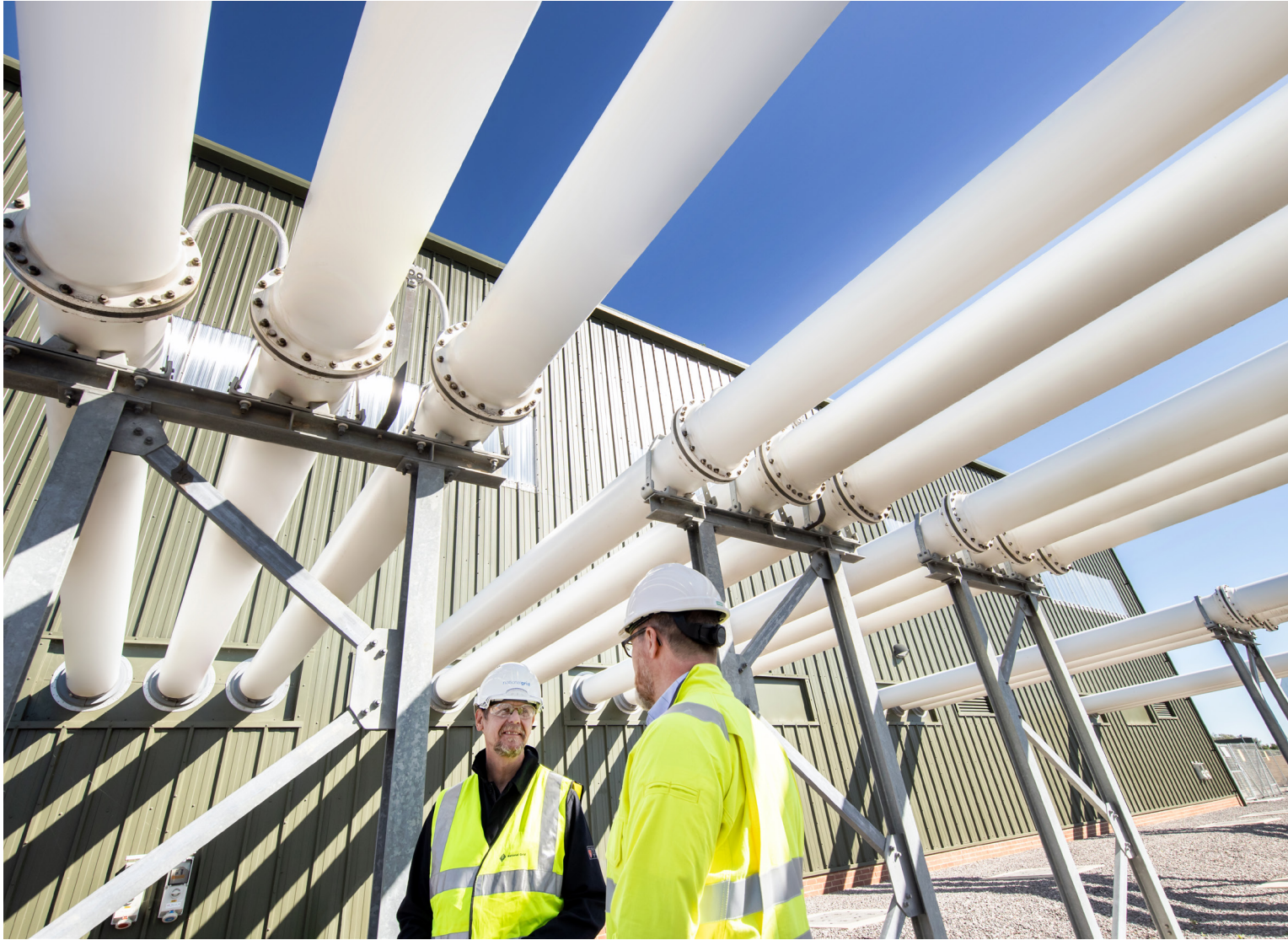
Hitachi Energy's EconiQ™ Retrofill replaces SF 6 in existing high-voltage equipment with an eco-efficient gas mixture.

THE NEW SOLUTION HAS TO BE AS RELIABLE AS SF 6 IS TODAY... SECONDLY, WE NEED TO ACHIEVE A BALANCE BETWEEN A GAS THAT IS AS GOOD AT INTERRUPTION AND INSULATION, BUT IS SIGNIFICANTLY BETTER THAN SF 6 WHEN IT COMES TO THE GLOBAL WARMING POTENTIAL... AND AT THE END OF THE DAY, WE ALSO NEED TO HAVE A SOLUTION THAT SOMEHOW FITS INTO THE CONCEPT OF THE EXISTING SUBSTATION.